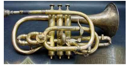
American model photo & restoration by Robb Stewart (below & photo 3 right)